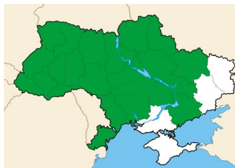
Figure 3 – @FindPropertyBot application geography (October 2022).

The bot covered almost all of Ukraine - it's 21 regions, where separate cities are selected for search in each region. The bot does not work in Donetsk, Luhansk, Kherson, part of Zaporizhzhya regions and Crimea. The detailed geography of housing search in the bot is presented in Fig. 3.